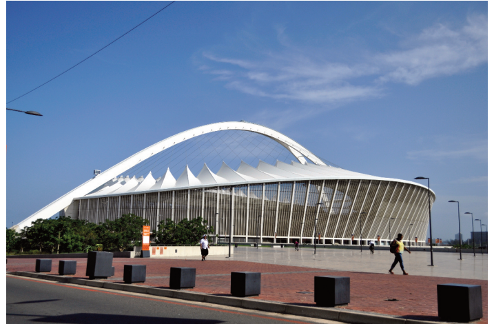
The modern design of the Moses Mabhida stadium is a striking addition to the Durban, South Africa cityscape

thriving environment would need to perform under a host of conditions – wet, slippery, hot and cold. Floors would have to endure heavy foot traffic and wheeled equipment as well as the extreme temperature conditions of commercial ovens and large refrigeration systems. In addition, decision-makers and stadium planners required a floor with a decorative finish to complement the sophisticated design of the stadium. Stonhard's Stonshield UTS met all criteria and the positive results have been recognized by stadium management. In fact, StonCor Africa was contracted soon after to perform similar work in First National Bank Stadium (also known as "Soccer City" Stadium) in Johannesburg.